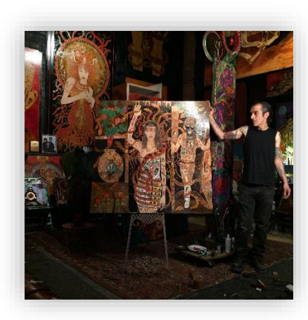
Negative Space Gallery has been a Project Support recipient for the past three years.

The purpose of Cuyahoga Arts & Culture's Project Support (PS) grant program is to promote public access and encourage the breadth of arts and cultural programming in our community by supporting Cuyahoga County-based projects. Grant applications are reviewed annually through a public panel review process. CAC will offer two Project Support grant options in 2018 for projects occurring in the January 1 – December 31, 2019 grant period. This document provides the guidelines and application instructions for the Project Support II program.